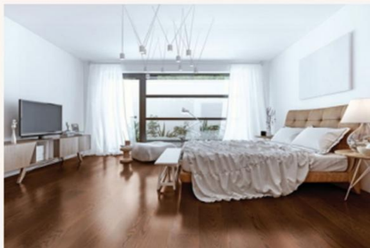
Mikasa Oak Summer