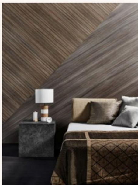
Woodgrain Collection by Greenlam Laminates

A blanket of white: Amidst the autumn leaves carrying hints of gold, reds and oranges, the winter season has subtly snuggled its