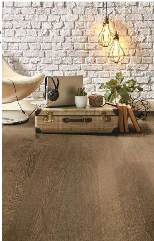
The feel of wood

Engineered wooden floors are setting a new trend in the flooring material category. Check out the latest Oak Stein by Mikasa premium engineered wooden floors from the house of Greenlam Industries Ltd. With hints of beige, brown and green, kindle your space with boundless passion and make it your own refuge from the world.