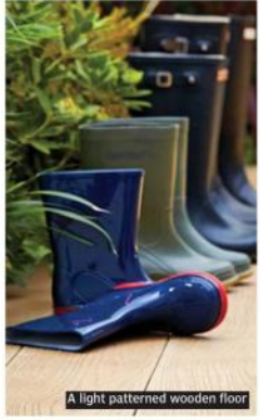
A light patterned wooden floor

Lately, the industry has seen a surge of adding patterns and textures which give respite from monotonous and dull interiors. Creative patterns, eye-catching textures, accent pieces are not only easy to integrate but add an elegant look and feel to your home. The top three trends are herringbone, chevron and geometric patterns. "With autumn, it's all about adding that subtle oomph but also maintaining a definite serenity in your house. The criss-cross chevron pattern on your floors with the Herringbone adds sophistication to your setting and really helps raise the luxe factor of your home. Whereas, geometric patterns create a subtle contrast and make the space incredibly modern and chic. Experiment these patterns with other elements of your space, such as a collage of rectangular and square frames with monochrome pictures and pairing it with hints of green plants would give your home a fresh and natural look. Chevron patterns on throw pillows, a coffee table with herringbone pattern or royal geometric patterned rugs are some ways to apply these trends to your house with minimal effort," explains Mittal.