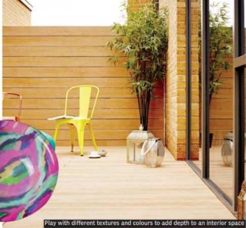
Play with different textures and colours to add depth to an interior space