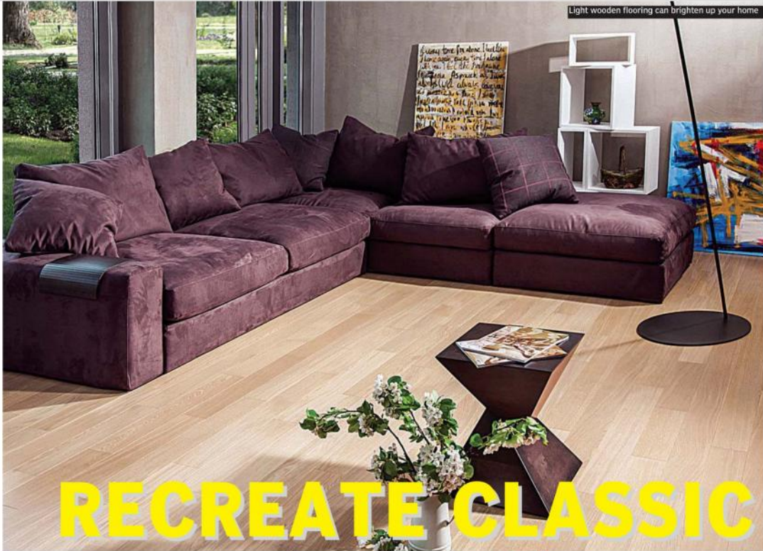
Light wooden flooring can brighten up your home