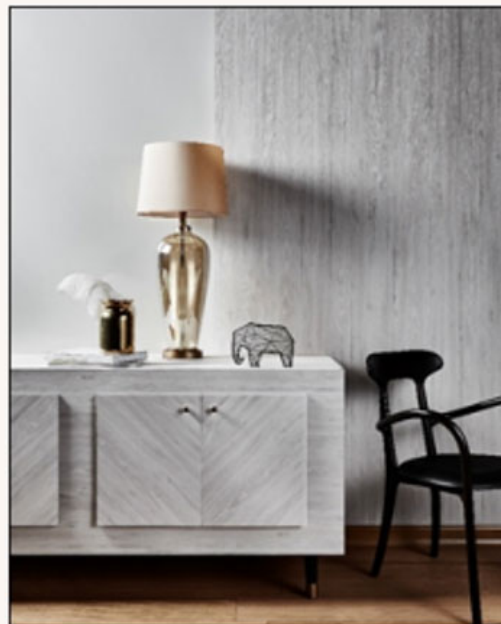
Greenlam Argent Elm

Upbeat twilight : If your home mainly consists of a dark theme, with dusky veneers and ebony elements, the best thing to do this Christmas would be to bring some statement pieces to your décor. Incorporating bright bursts of intense color to your furniture will make your décor stand out without upsetting the overall theme of your home. For instance, add pops of cheerful colors such as cherry red that look striking to the eye. Add a dash of red in an all-black because it works like a charm in the form of wall art or a bold red chair. Pair these statement pieces with classic Mikasa Noce Rosso floors to add a distinct jovial touch to it and watch your interiors come alive with exuberance! Another thing that looks stunning in a dark space are lights. Bright lights instantly catch your eye against shadowy shades. You can make a canopy around your bed and decorate it with gorgeous fairy lights to add that starry glitz to your room. So, this winter