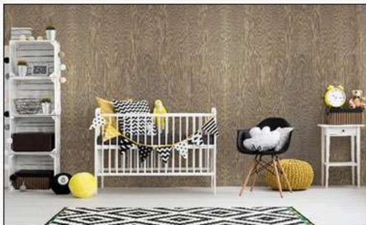
A Cocktail of Vivacity by Greenlam Industries

Oak Mist by Decowood from the house of Greenlam Industries Ltd. provides the right amount of sophistication to your walls with elegant textures. Give a fresh new look to your space by playing with eccentric geometric patterns. Mix and match your cushions, bed sheets or rugs adorned with patterns such as zig-zag or striped lines, polka dots and more. Go for timeless colour combinations like yellow, black, white and shades of light brown to infuse vibrancy in your furnishings. The secret sauce to ace a balanced home décor look is to blend all these elements in such a way that your room looks uncluttered and vibrant.