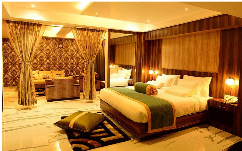
Bring in a vivid combination through a stunning white couch with a combination of emerald green and black and white chevron patterned cushions.

* To bring in the whimsical vibe of hotel décor, choose a palette which is elegant but relaxed, with whimsical and playful touches. For example, a gently muted mix of romantic powder pinks (super candy) and blues create (satin blue) calm, with spiced honey bringing depth and sophistication to the look. Plain, pale wood, simple hand-made vessels and pretty fabrics add to the contemplative, centred feel of this home.