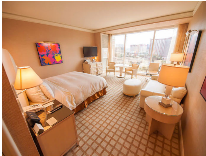
To bring in the whimsical vibe of hotel décor, choose a palette which is elegant but relaxed, with whimsical and playful touches.