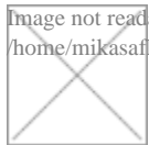
Image not readable or empty /home/mikasa/floors/public_html/sites/default/files/mikasa_logo_small.png